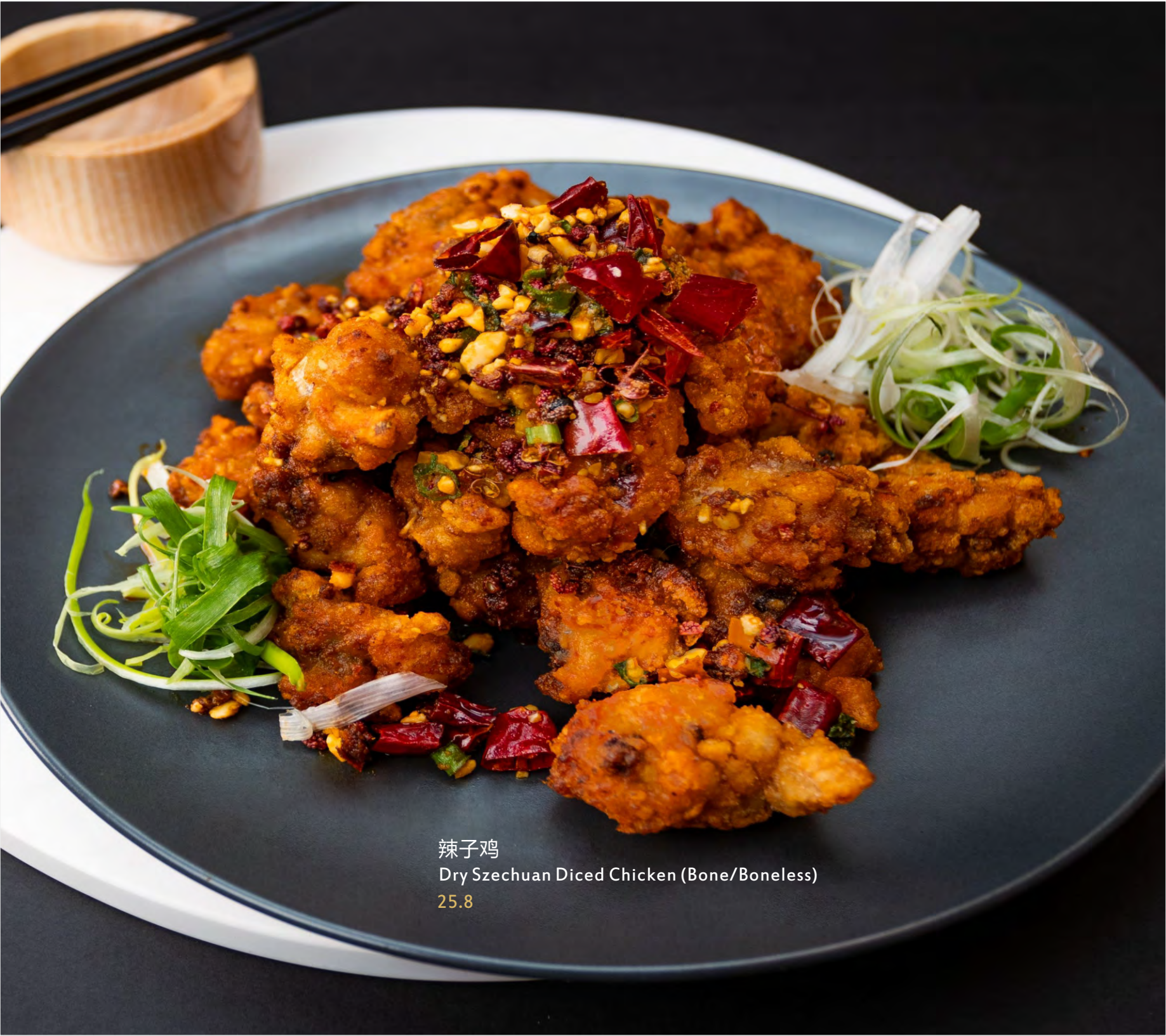
辣子鸡 Dry Szechuan Diced Chicken (Bone/Boneless) 25.8