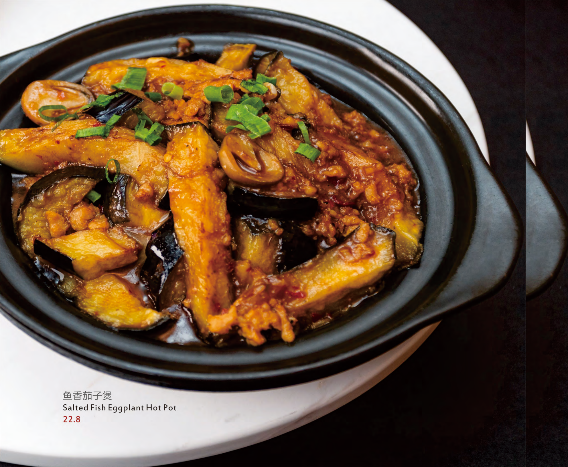
鱼香茄子煲 Salted Fish Eggplant Hot Pot 22.8