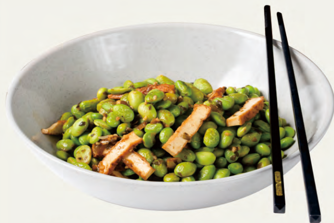
毛豆炒干豆 ▲ B.B.C (Broad Bean, Bean Curd With Chinese Chutney) 18.8