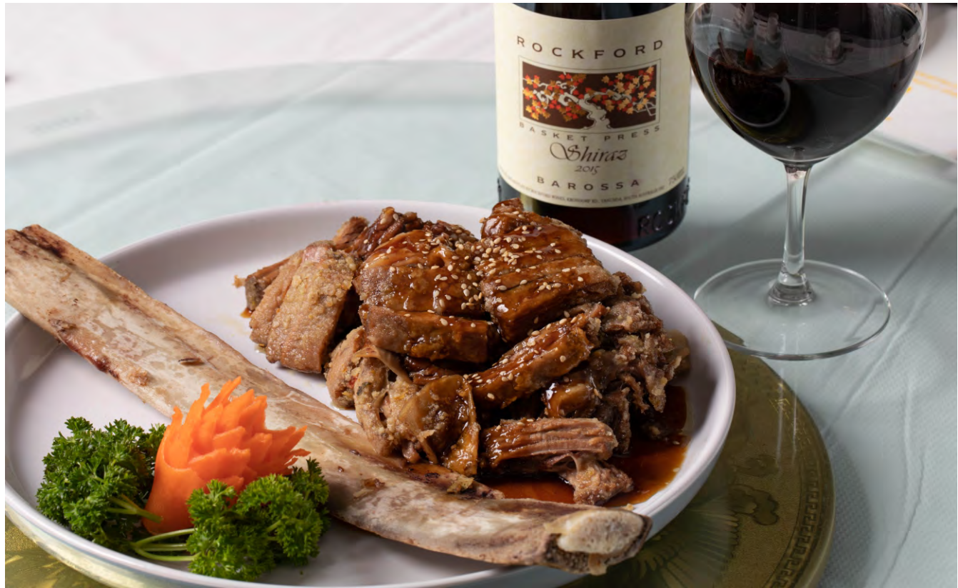
董式烤牛排 Chef Dong Special Beef Ribs 33.8 日式照烧牛柳 Sizzling Fillet Steak With Teriyaki Sauce 26.8