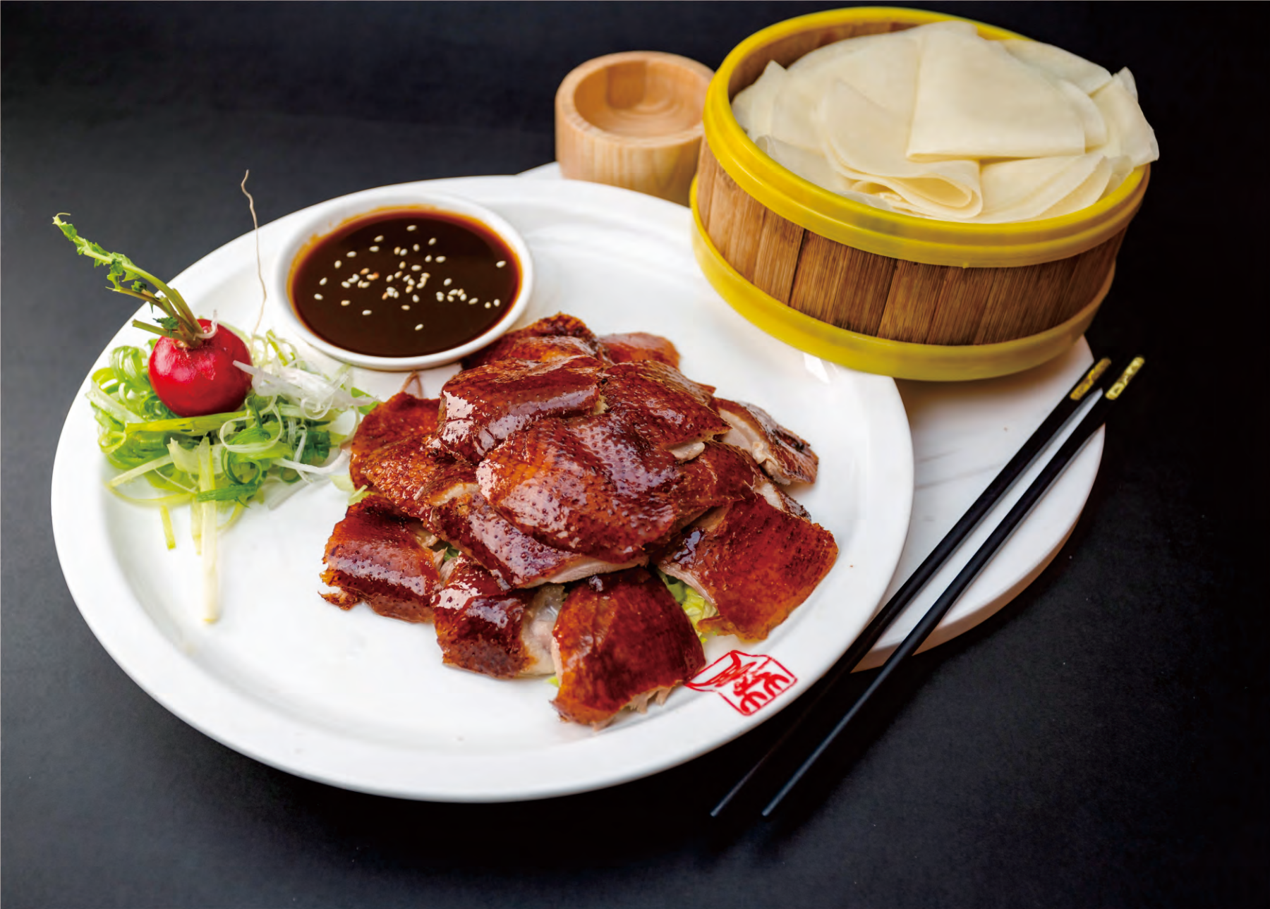
董家烧鸭 Chef Dong Roasted Duck (Half) 25.8