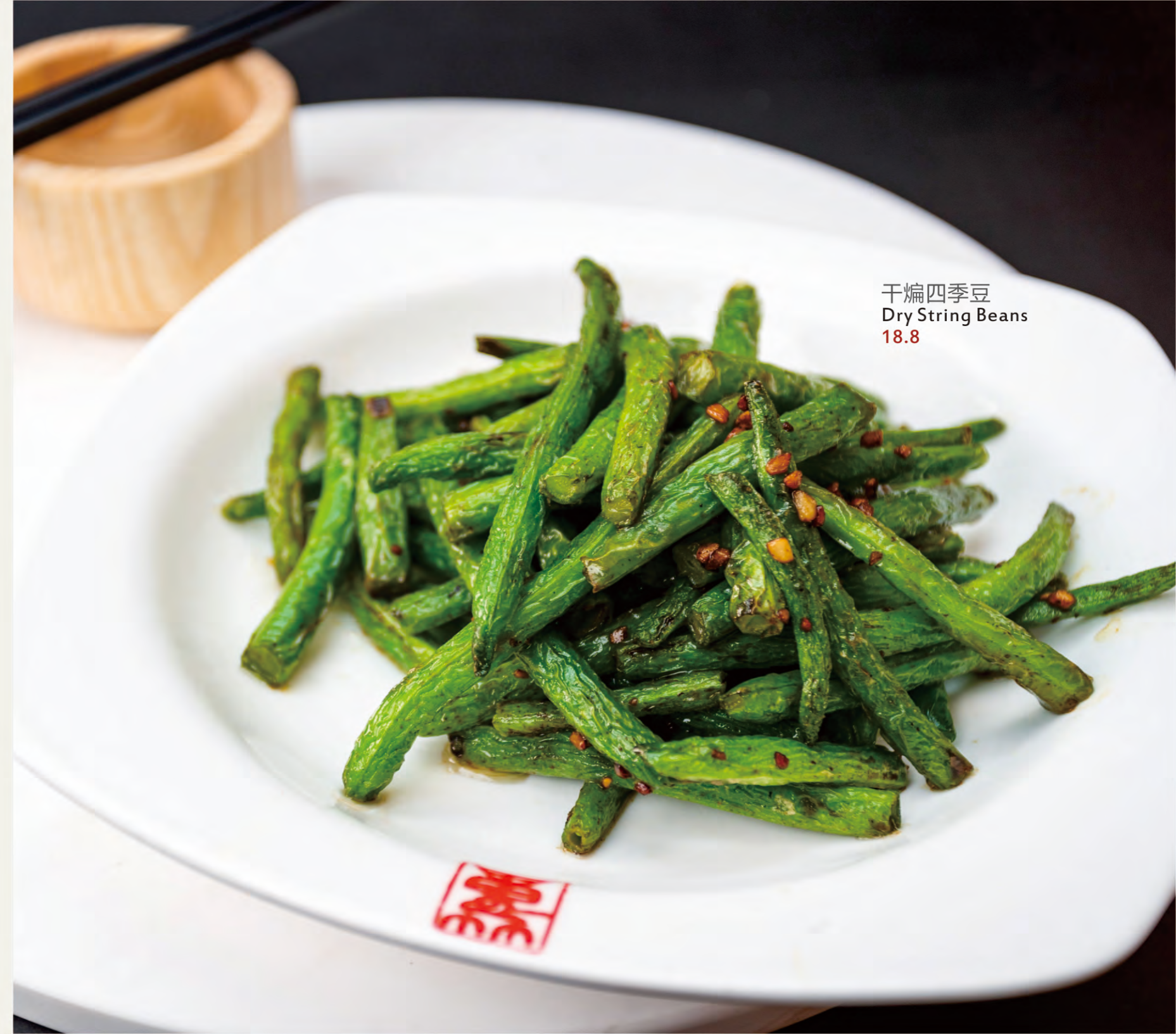
干煸四季豆 Dry String Beans 18.8