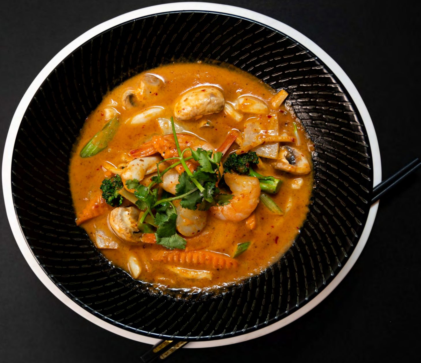
泰式海鲜烩 Red Curry Combination Seafood 28.8